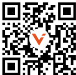
Scan for Apple devices

The Victor Response mobile app is available on the Apple Store or Google Play .