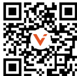
Scan for Android devices

Visit us at victorinsurance.ca/cyber to learn more.